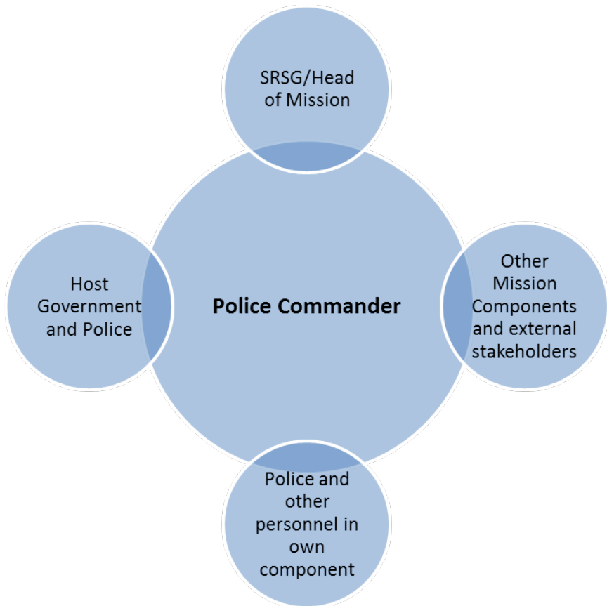
Figure 3: Command responsibilities

The Police Commander/HOPC has a number of command responsibilities: