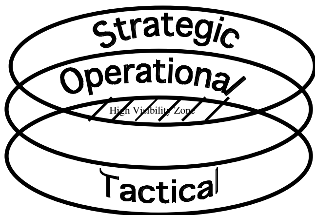
Figure 1. Levels of Peace Operations

three American soldiers. The news and their pictures on TV had effect on the strategic decision makers long before any explanation could be made on what transpired. In March 2000, angry demonstrators confronted NATO's Kosovo Force (KFOR) in the town of Metrovica. The situation was spiralling out of control, so General Wesley Clark, NATO Supreme Allied Commander Europe, approved the decision of the KFOR Commander to commit a battalion from the U.S. sector in the southeast to the French sector in the north. Seeing on television that American forces were being employed out of sector, the U.S. Government sent orders to General Clark to return the U.S. battalion to its sector. Soldiers, and more importantly leaders, in peace operations must think of the second and third order effects of any decision they make.