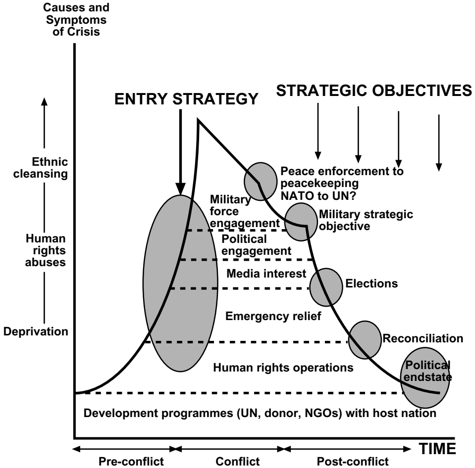
Figure 1: Hypothetical peace operations model

33. NATO doctrine goes far beyond ‘UN peacekeeping doctrine’ in acknowledging the utility of necessary force in pursuit of mission objectives. It states that: “NATO has the unique capability to deploy, direct, and command and control operations mounted to take peace enforcement action against those responsible for threats to peace or security, or who carry out acts of aggression. As such, this is the most likely task for a NATO force in support of the UN.” 13 The doctrine elaborates on the fact that the link between political and military objectives of peace enforcement must be very close, and that the aim of peace enforcement operations “...will not be the defeat or destruction of an enemy, but rather to compel or coerce any or all parties to comply with a particular course of action.” 14